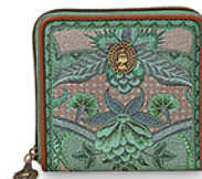
51.273.277 Wallet Square Kyoto Festival Green - 11.5x11.5x2.5 cm Artificial Leather - 1/96