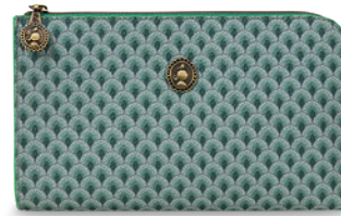
51.274.202 Cosmetic Zipper Pouch Suki Green - 21x12.5x3.5 cm Artificial Leather - 4/64