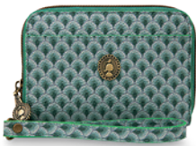
51.273.317 Wallet Suki Green - 14.2x10x2.3 cm Artificial Leather - 1/96