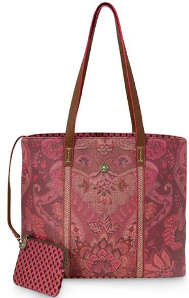
51.273.309 Shopper Medium Kyoto Festival Dark Pink - 32/47x31x18.5 cm Artificial Leather - I/I2