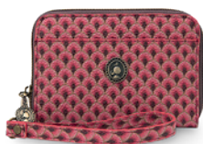
51.273.300 Wallet Suki Pink - 14.2x10x2.3 cm Artificial Leather - 1/96