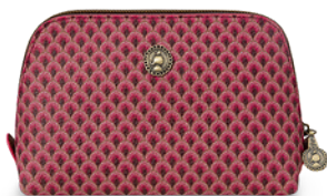
51.274.178 Cosmetic Bag Triangle Small Suki Pink - 19/15x12x6 cm Artificial Leather - 1/36