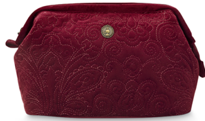
51.274.189 Cosmetic Purse Large Velvet Quiltey Days Red - 26x18x12 cm Velvet - 1/24