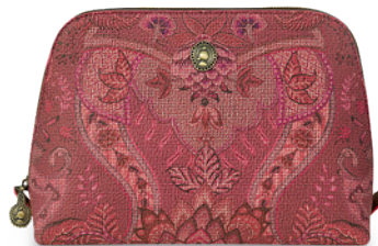
51.274.179 Cosmetic Bag Triangle Medium Kyoto Festival Dark Pink - 24/17x16.5x8 cm Artificial Leather - 1/24