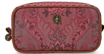
51.274.185 Cosmetic Bag Square Small Kyoto Festival Dark Pink - 20x10.5x7.5 cm Artificial Leather - 1/48