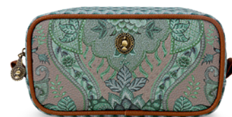
51.274.200 Cosmetic Bag Square Small Kyoto Festival Green - 20x10.5x7.5 cm Artificial Leather - 1/48