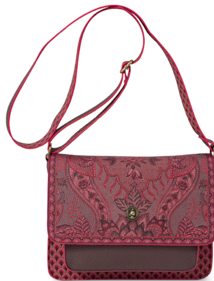
51.273.306 Cross Body Flap Kyoto Festival Dark Pink - 25x7x20 cm Artificial Leather - 1/12