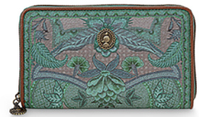
51.273.279 Wallet Kyoto Festival Green - 18x11x3 cm Artificial Leather - 1/60