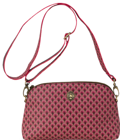
51.273.304 Cross Body Bag Small Suki Pink - 22x13.5x6 cm Artificial Leather - 1/36