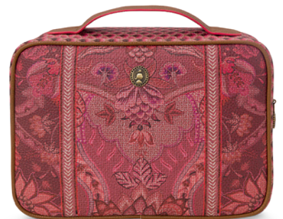
51.274.177 Beauty Case Square Large Kyoto Festival Dark Pink - 27x19x10 cm Artificial Leather - 1/12