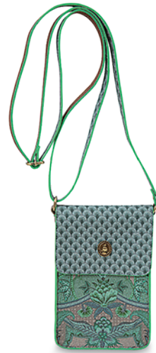
51.273.282 Phone Bag Kyoto Festival Green - 13x20x4.7 cm Artificial Leather - 1/72