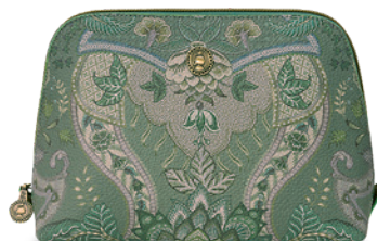
51.274.194 Cosmetic Bag Triangle Medium Kyoto Festival Green - 24/17x16.5x8 cm Artificial Leather - 1/24