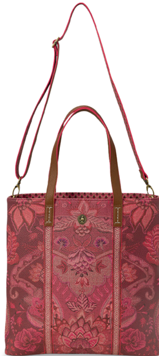
51.273.310 Shopper Square Kyoto Festival Dark Pink - 33x36x10 cm Artificial Leather - I/I2