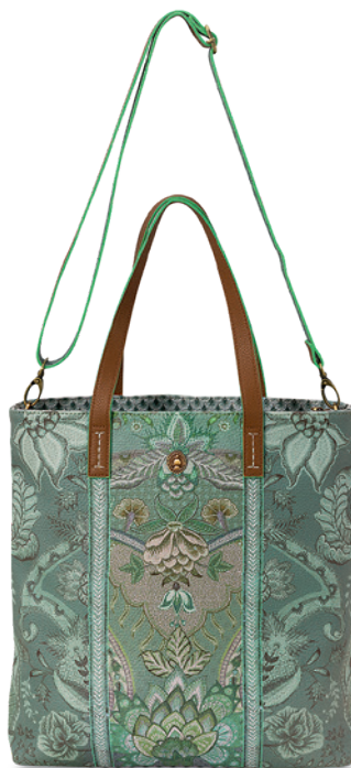
51.273.292 Shopper Square Kyoto Festival Green - 33x36x10 cm Artificial Leather - I/12