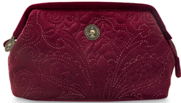
51.274.188 Cosmetic Purse Small Velvet Quiltey Days Red - 19x12x8.5 cm Velvet - 1/36