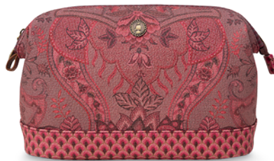
51.274.184 Cosmetic Purse Large Kyoto Festival Dark Pink - 26x18x12 cm Artificial Leather - 1/24