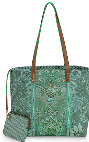
51.273.291 Shopper Medium Kyoto Festival Green - 32/47x31x18.5 cm Artificial Leather - I/12