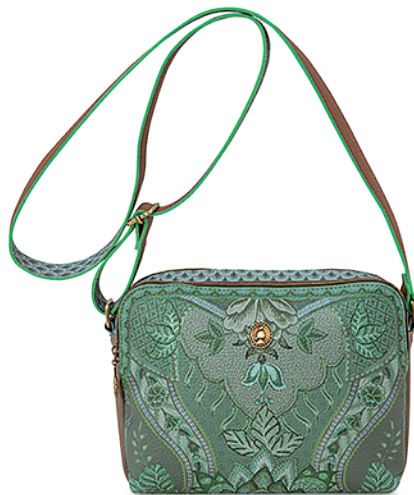
51.273.286 Cross Body Medium Kyoto Festival Green - 23.5x18x7.5 cm Artificial Leather - 1/24