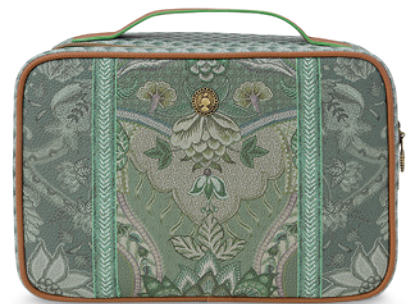
51.274.192 Beauty Case Square Large Kyoto Festival Green - 27x19x10 cm Artificial Leather - 1/12