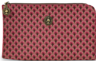
51.274.187 Cosmetic Zipper Pouch Suki Pink - 21x12.5x3.5 cm Artificial Leather - 4/64