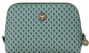
51.274.193 Cosmetic Bag Triangle Small Suki Green - 19/15x12x6 cm Artificial Leather - 1/36