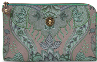
51.274.201 Cosmetic Zipper Pouch Kyoto Festival Green - 21x12.5x3.5 cm Artificial Leather - 4/64