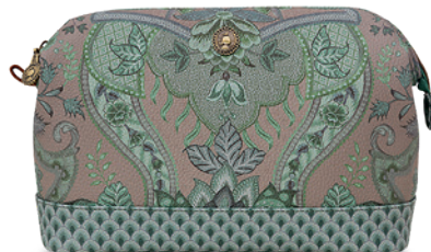
51.274.199 Cosmetic Purse Large Kyoto Festival Green - 26x18x12 cm Artificial Leather - 1/24