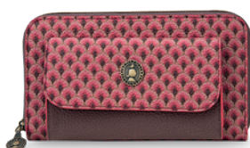
51.273.301 Wallet Pocket Suki Pink - 19.5x11x4.5 cm Artificial Leather - 1/60