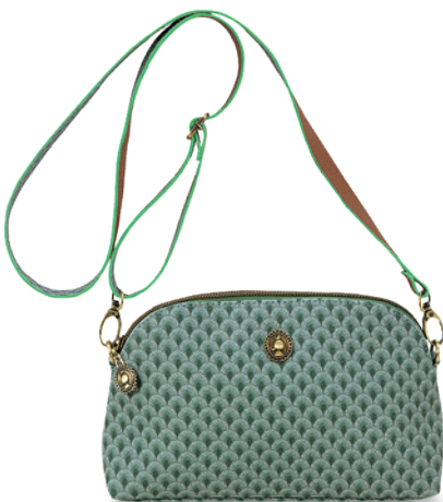
51.273.285 Cross Body Bag Small Suki Green - 22x13.5x6 cm Artificial Leather - 1/36