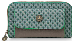
551.273.318 Wallet Pocket Suki Green - 19.5x11x4.5 cm Artificial Leather - 1/60