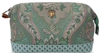
51.274.198 Cosmetic Purse Medium Kyoto Festival Green - 22.5x9.5x15 cm Artificial Leather - 1/36