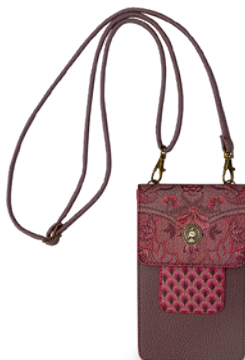
51.273.302 Phone Bag Kyoto Festival Dark Pink - 11x18x1 cm Artificial Leather - 1/48