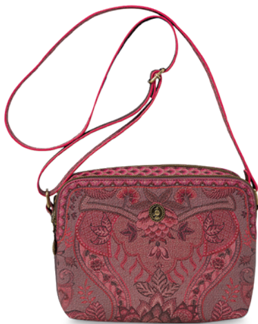
51.273.305 Cross Body Medium Kyoto Festival Dark Pink - 23.5x18x7.5 cm Artificial Leather - 1/24