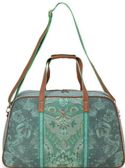
51.273.294 Weekend Bag Medium Kyoto Festival Green - 57x22x37 cm Nylon/Satin - 1/12