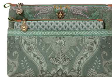
51.274.197 Cosmetic Bag Combi Kyoto Festival Green - 26x18x7.5cm/22x13x1 cm Artificial Leather - 1/12