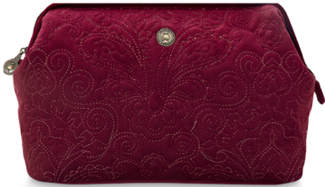
51.274.190 Cosmetic Purse Extra Large Velvet Quiltey Days Red - 30x20.7x13.8 cm Velvet - 1/16