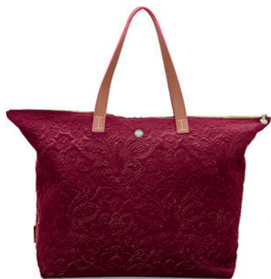
51.273.315 Tote Bag Velvet Quiltey Days Red - 66x20x44 cm Velvet - 1/24