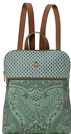
51.273.289 Backpack Kyoto Festival Green - 28x36x11 cm Artificial Leather - I/12