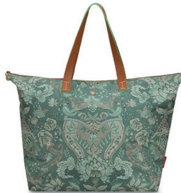
51.273.314 Tote Bag Kyoto Festival Green - 66x20x44 cm Nylon/Satin - 1/24