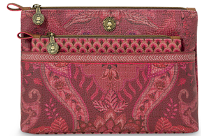
51.274.182 Cosmetic Bag Combi Kyoto Festival Dark Pink - 26x18x7.5cm/22x13x1 cm Artificial Leather - 1/12