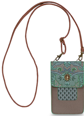
51.273.281 Phone Bag Kyoto Festival Green - 11x18x1 cm Artificial Leather - 1/48