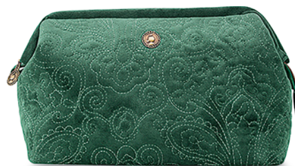
51.274.174 Cosmetic Purse Large Velvet Quilted Green - 26x18x12 cm Velvet - 1/24