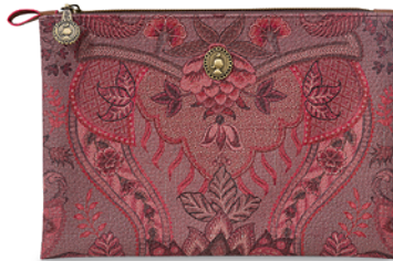
51.274.181 Cosmetic Flat Pouch Medium Kyoto Festival Dark Pink - 24x15.5x1 cm Artificial Leather - 1/48