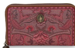
51.273.299 Wallet Kyoto Festival Dark Pink - 18x11x3 cm Artificial Leather - 1/60