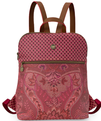
51.273.307 Backpack Kyoto Festival Dark Pink - 28x36x11 cm Artificial Leather - I/I2