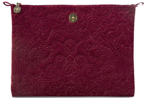
51.274.191 Cosmetic Flat Pouch Large Velvet Quiltey Days Red - 30x22x1 cm Velvet - 1/60