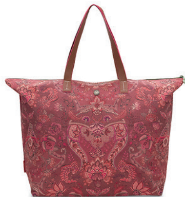
51.273.313 Tote Bag Kyoto Festival Dark Pink - 66x20x44 cm Nylon/Satin - 1/24