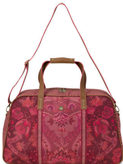
51.273.311 Weekend Bag Medium Kyoto Festival Dark Pink - 57x22x37 cm Nylon/Satin - 1/12