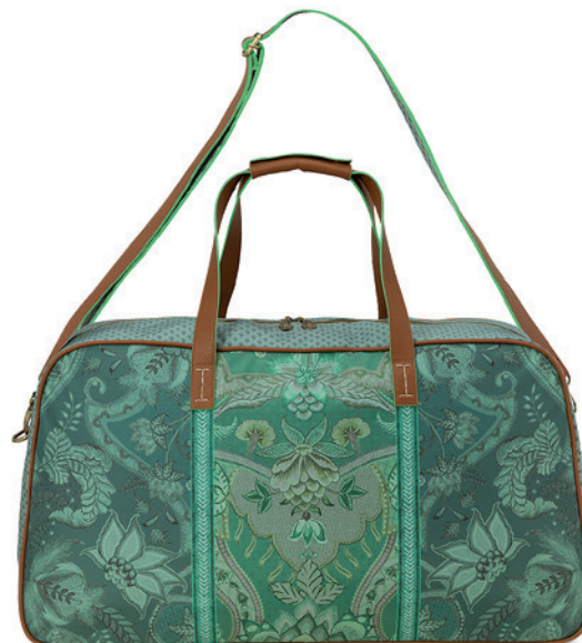
51.273.296 Weekend Bag Large Kyoto Festival Green - 65x25.5x35 cm Nylon/Satin - 1/12