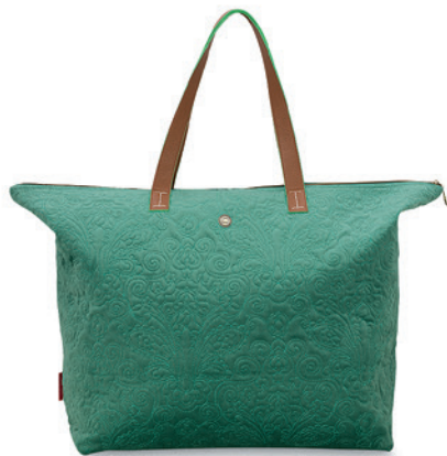
51.273.316 Tote Bag Velvet Quiltey Days Green - 66x20x44 cm Velvet - 1/24