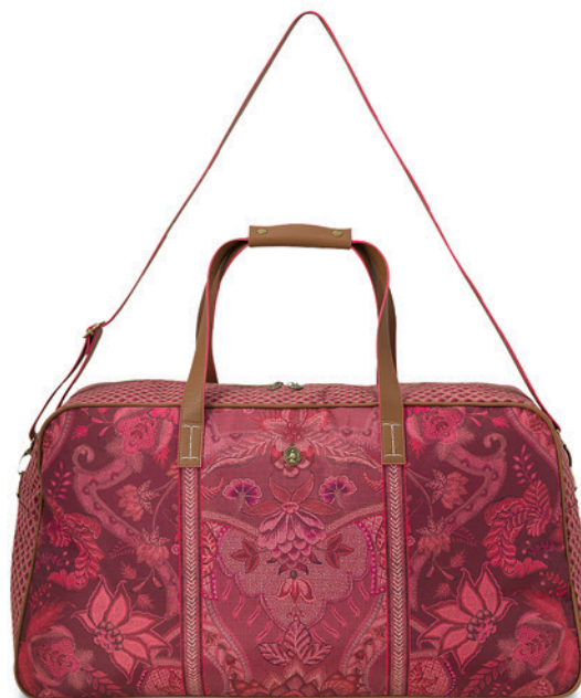
51.273.312 Weekend Bag Large Kyoto Festival Dark Pink - 65x25.5x35 cm Nylon/Satin - 1/12