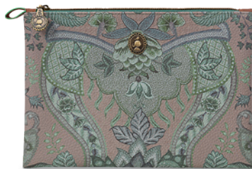
51.274.196 Cosmetic Flat Pouch Medium Kyoto Festival Green - 24x15.5x1 cm Artificial Leather - 1/48