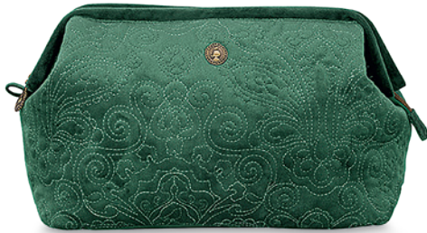
51.274.175 Cosmetic Purse Extra Large Velvet Quilted Green - 30x20.7x13.8 cm Velvet - 1/16