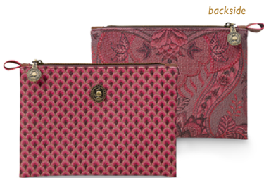
51.274.180 Cosmetic Flat Pouch Small Kyoto Festival/Suki Dark Pink - 19.5x13x1 cm Artificial Leather - 1/48