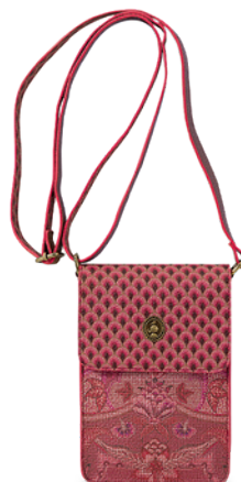
51.273.303 Phone Bag Kyoto Festival Dark Pink - 13x20x4.7 cm Artificial Leather - 1/72