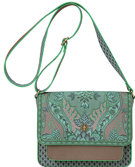
51.273.288 Cross Body Flap Kyoto Festival Green - 25x7x20 cm Artificial Leather - 1/12