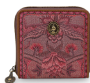
51.273.298 Wallet Square Kyoto Festival Dark Pink - 11.5x11.5x2.5 cm Artificial Leather - 1/96