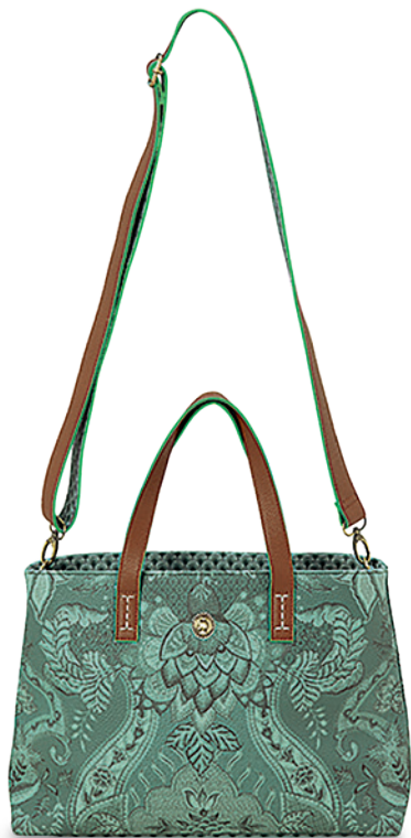
51.273.290 Shopper Small Kyoto Festival Green - 33/39x22x10 cm Artificial Leather - I/12