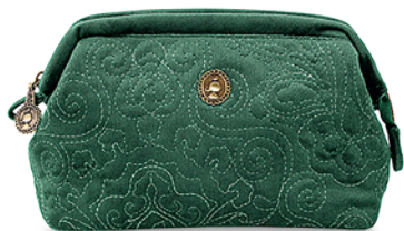
51.274.173 Cosmetic Purse Small Velvet Quilted Green - 19x12x8.5 cm Velvet - 1/36