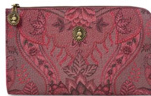
51.274.186 Cosmetic Zipper Pouch Kyoto Festival Dark Pink - 21x12.5x3.5 cm Artificial Leather - 4/64