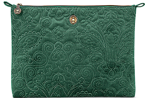
51.274.176 Cosmetic Flat Pouch Large Velvet Quilted Green - 30x22x1 cm Velvet - 1/60