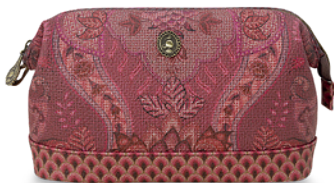
51.274.183 Cosmetic Purse Medium Kyoto Festival Dark Pink - 22.5x9.5x15 cm Artificial Leather - 1/36