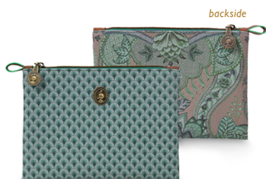
51.274.195 Cosmetic Flat Pouch Small Kyoto Festival/Suki Green - 19.5x13x1 cm Artificial Leather - 1/48