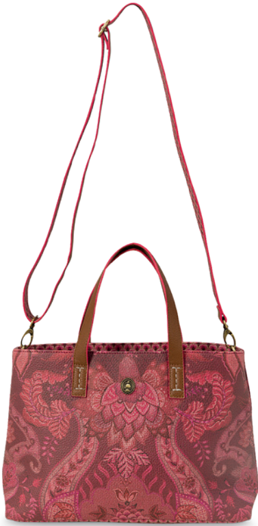
51.273.308 Shopper Small Kyoto Festival Dark Pink - 33/39x22x10 cm Artificial Leather - I/I2