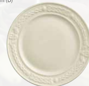
4218 Claddagh 5" Plate 19.1cm (D)