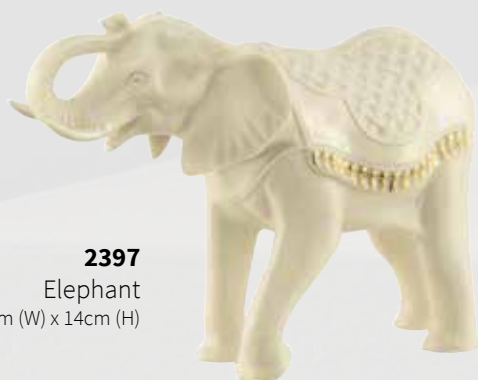
2397 Elephant 20.3cm (L) x 7.4cm (W) x 14cm (H)