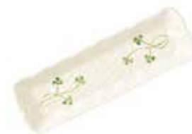
2083 Shamrock Mint Tray 24.1cm (L) x 7.6cm (W) x 1.9cm (H)