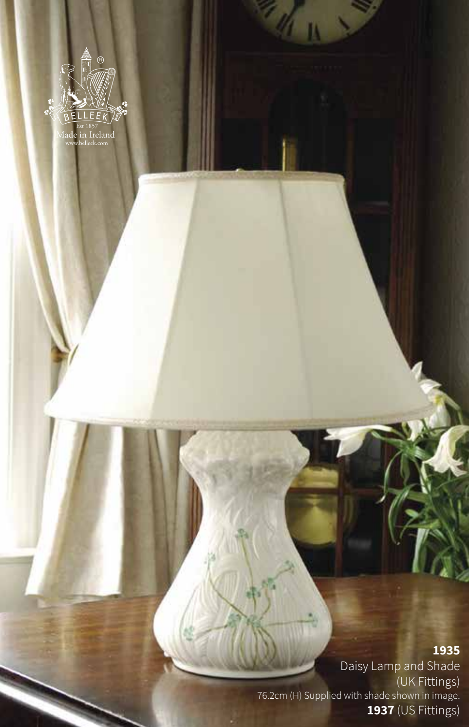
1935 Daisy Lamp and Shade (UK Fittings) 76.2cm (H) Supplied with shade shown in image. 1937 (US Fittings)