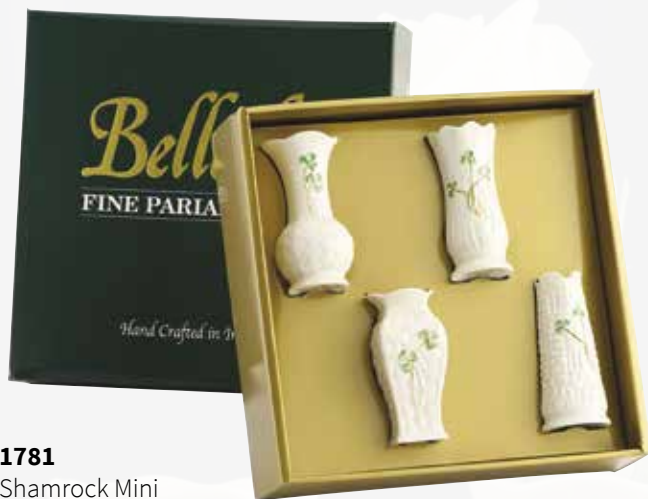
1781 Shamrock Mini Vases (set of 4) 4.1cm (W) x 10.2cm (H) each