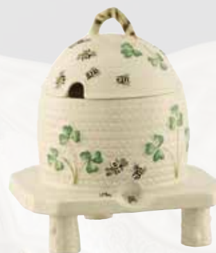
0043 Shamrock Honey Pot and Stand 13.2cm (L) x 13cm (W) x 15.5cm (H)