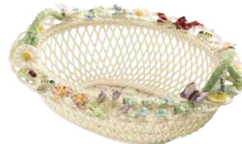
3600 Queens Basket 19.8cm (L) x 15.7cm (W) x 8.1cm (H)