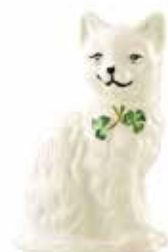
2200 Quizzical Cat 8.6cm (W) x 11.4cm (H)