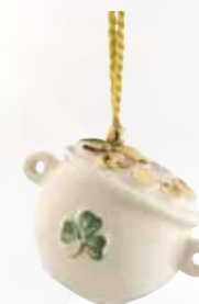
4656 Pot of Gold Ornament 7cm (L) x 4.5cm (H)