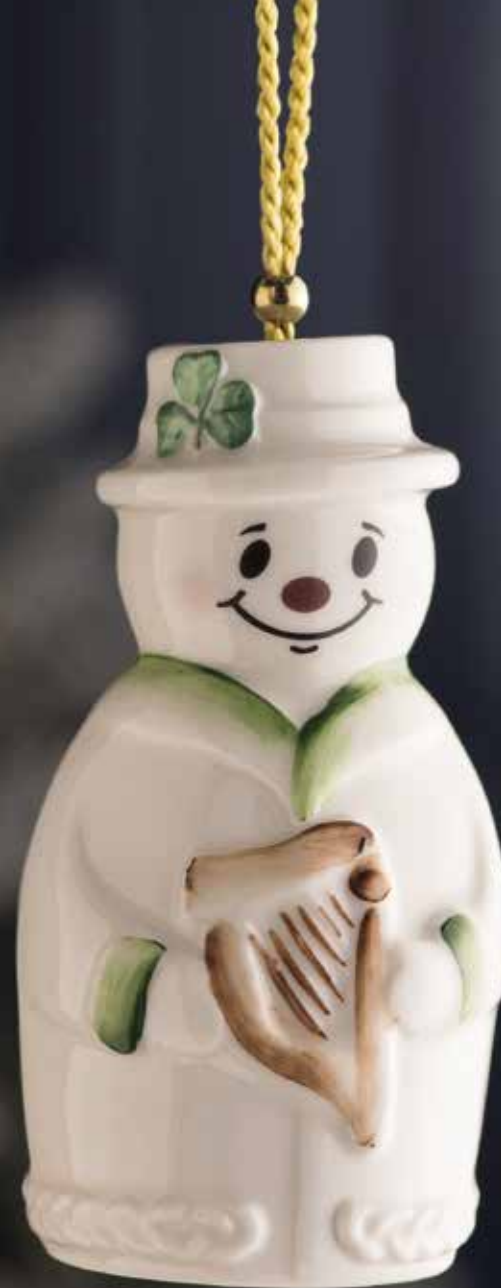
4654 Snowman Bell Ornament 6.4cm (W) x 7.6cm (H)