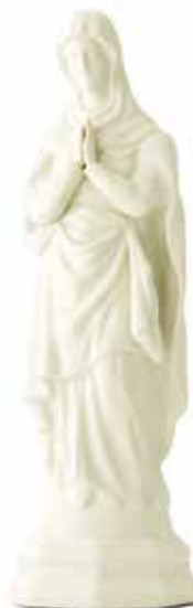
0480 Blessed Virgin Mary 11cm (W) x 31cm (H)