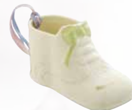
4423 Baby's First Christmas Ornament 9.6cm (L) x 5cm (W) x 5.3cm (H)