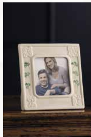
4196 3"x 3" Personalised Frame