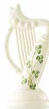
0514 Harp 7cm (W) x 16.3cm (H)