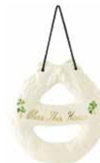
2292 House Blessing Wreath 15.9cm (D)