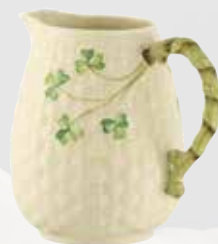
0039 Shamrock Round Bottomed Jug 11.7cm (L) x 8.9cm (W) x 11.4cm (H)