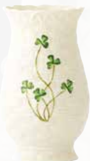
2675 Kylemore 7" Vase 8.9cm (W) x 17.8cm (H)