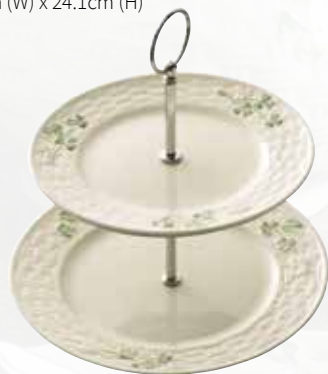
0174 Shamrock Tiered Server ^ 22.6cm (W) x 24.1cm (H)