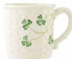
1940 Shamrock Baby Cup 9cm (W) x 6.6cm (H)