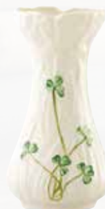
1934 Daisy Toy Spill Vase 6.1cm (W) x 11.3cm (H)