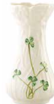
1934 Daisy Toy Spill Vase 6.1cm (W) x 11.3cm (H)