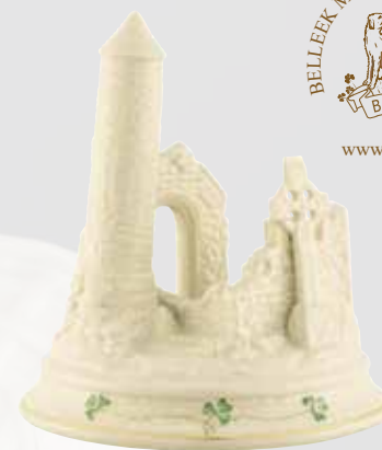
2008 Devenish Round Tower 15.7cm (D) x 17.8cm (H)