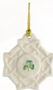
1994 St. Brigid's Cross Ornament 10.2cm (W) x 10.2cm (H)