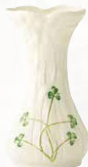
0517 Daisy Spill Vase 8.1cm (W) x 15.6cm (H)