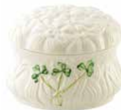
1936 Daisy Trinket Box 8.6cm (W) x 8.4cm (H)