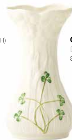
0517 Daisy Spill Vase 8.1cm (W) x 15.6cm (H)