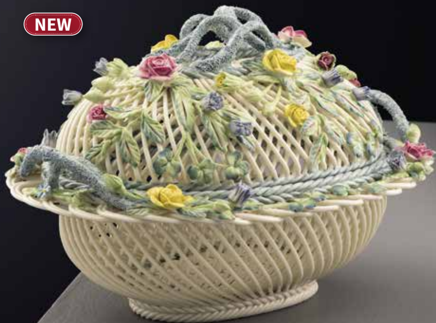
0569 Oval Covered Basket S/S 17.8cm (L) x 21.8cm (W) x 14cm (H)