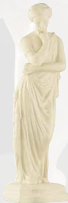
0626 Meditation 11.4cm (L) x 11.2cm (W) x 36.6cm (H)