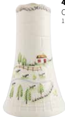
4577 Connemara 9" Vase 14.7cm (D) x 22.9cm (H)