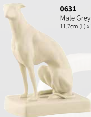
0631 Male Greyhound Sitting 11.7cm (L) x 7.6cm (W) x 16.3cm (H)