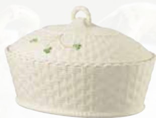
1325 Shamrock Oval Covered Dish 23.9cm (L) x 20.3cm (W) x 15.2cm (H) x 1390mlC each