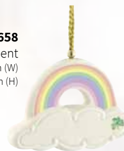
4658 Rainbow Ornament 20cm (L) x 8.4cm (W) x 6.4cm (H)