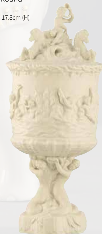
0647 Prince of Wales Icepail 20.3cm (W) x 49.8cm (H)