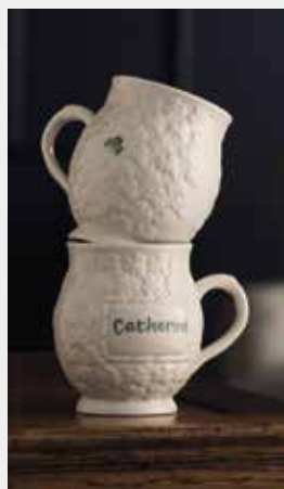
4507 Lucky Shamrocks Personalised Mug