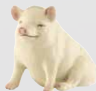
0456 Pig L/S 10.1cm (L) x 5.6cm (W) x 7.6cm (H)