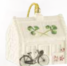
4425 Nell's Cottage Ornament 5.3cm (L) x 4.4cm (W) x 5.3cm (H)