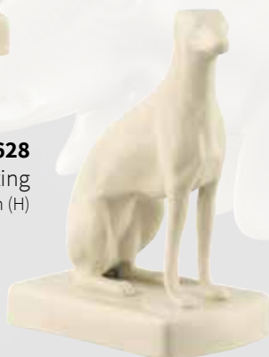
0628 Female Greyhound Sitting 11.7cm (L) x 7.6cm (W) x 15.7cm (H)