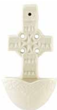
0497 Celtic Cross Font 8.1cm (W) x 19cm (H)