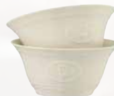
4216 Claddagh Bowls Set of 2 15.2cm (W) x 7.6cm (H) x 591mlC each