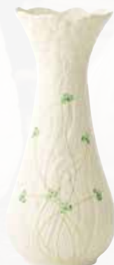
1932 Daisy Vase Tall 10.2cm (W) x 26.7cm (H)