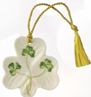
1810 Shamrock Shaped Ornament 5.8cm (W) x 6.4cm (H)