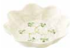
2130 Shamrock Sweet Dish 11.9cm (W) x 2cm (H)

The Shamrock Giftware collection includes a wide range of giftware pieces all featuring the hand painted shamrocks which have become synonymous with Belleek. These are gifts that will be treasured for years to come.