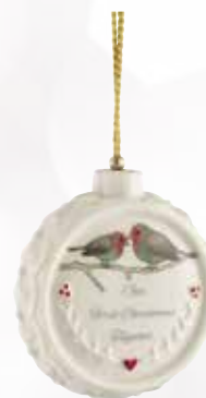
4653 Our First Christmas Ornament 7.6cm (W) x 8.9cm (H)