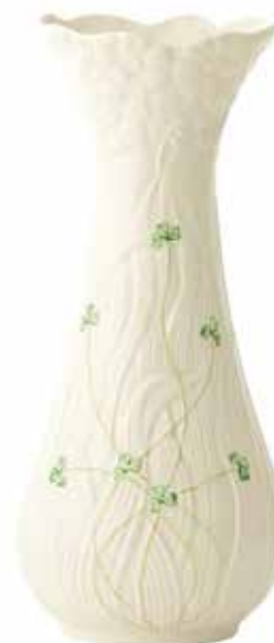
1932 Daisy Vase Tall 10.2cm (W) x 26.7cm (H)