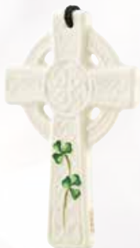
3517 St. Kieran's Celtic Cross Ornament 8.9cm (W) x 12.7cm (H)