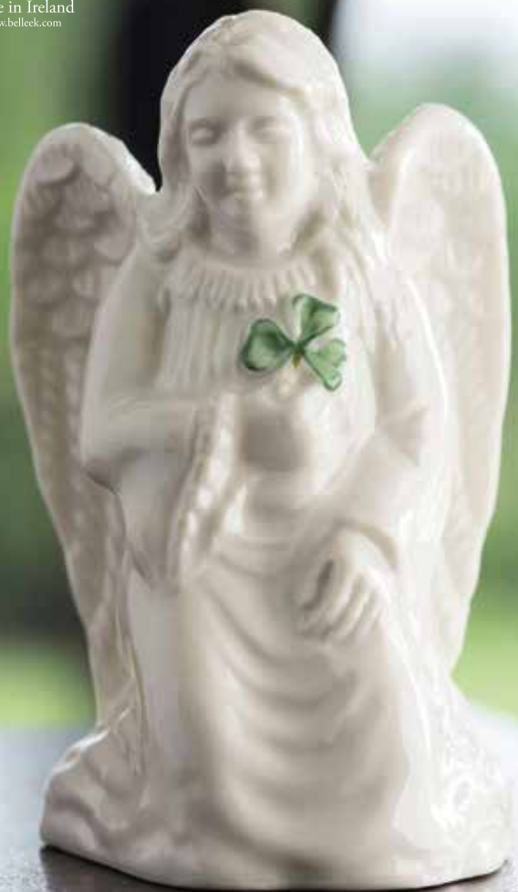
4249 Angel of Protection 5.5cm (L) x 5.3cm (W) x 8.4cm (H)