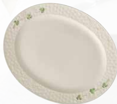
1326 Shamrock Large Oval Platter 38.1cm (L) x 30.5cm (W) x 3cm(H)