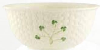
1316 Shamrock Mixing Bowl 24.1cm (D) x 10.9cm (H)