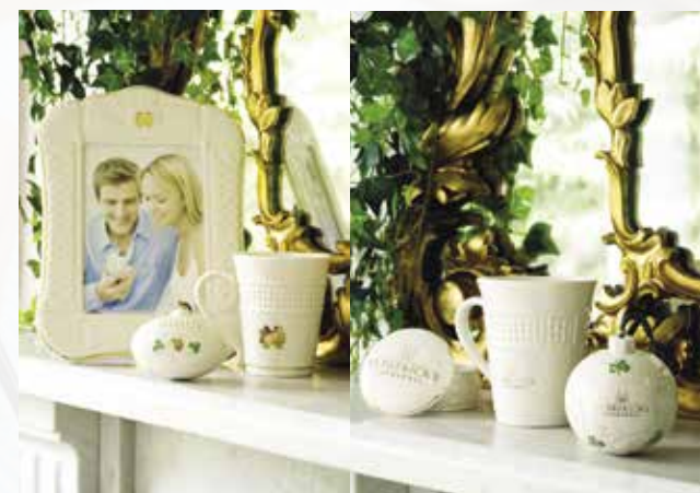
Examples of Corporate Logos/Monogramming.