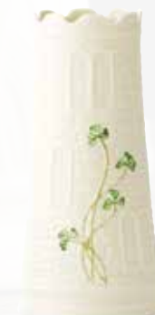
2223 Castle 7.7" Vase 9.9cm (W) x 19.6cm (H)