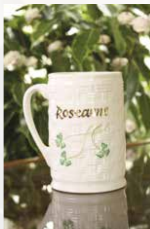
3204 Personalised Mug