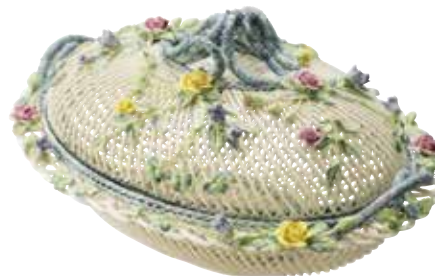
0588 Oval Covered Basket L/S 29cm (L) x 21.3cm (W) x 16.3cm (H)