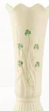
2082 Woodland Vase 11.7cm (W) x 25.4cm (H)