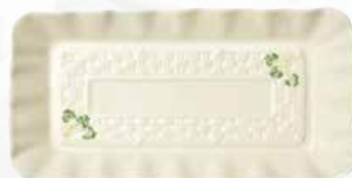
1317 Shamrock Tray 32cm (L) x 16cm (W) x 3.8cm (H)

Beautiful and functional Shamrock Kitchenware incorporates Belleek's iconic basketweave and hand painted shamrocks into product designs that enhance the Shamrock Tableware collection and can be used in your kitchen everyday.