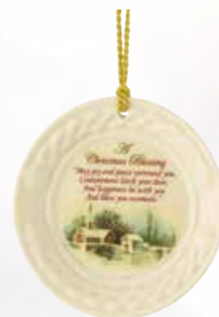
4388 Christmas Scene Ornament 8.9cm (D) x 0.8cm (H)