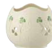
4354 Shamrock Lace Pierced Votive (Tealight included) 10.7cm (W) x 8.6cm (H)