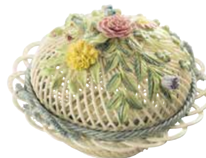
4544 Round Covered Basket S/S 17.3cm (D) x 11.4cm (H)