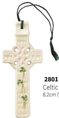
2801 Celtic Wall Cross 8.2cm (W) x 19cm (H)