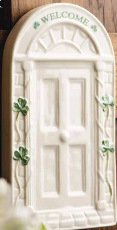
3421 Welcome Door Wall Plaque 9.4cm (L) x 1.5cm (W) x 17cm (H)