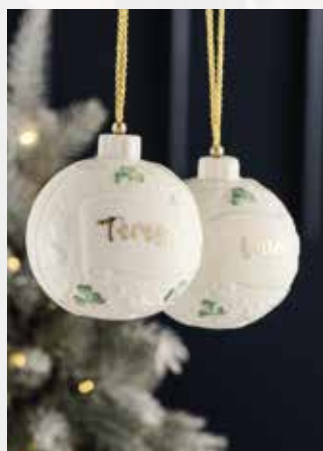
3621 Personalised Bauble