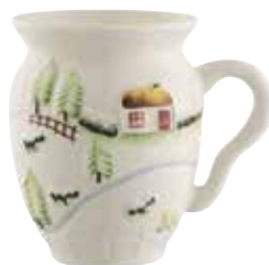
4558 Connemara Mug 11.4cm (W) x 10.2cm (H) x 375mlC