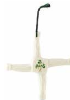
3425 St. Brigid's Cross 19.1cm (W) x 19.1cm (H)