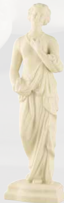
0627 Affection 11.4cm (L) x 11.2cm (W) x 36.6cm (H)