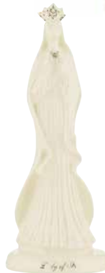
4140 Lady of Knock Statue 28cm (H)