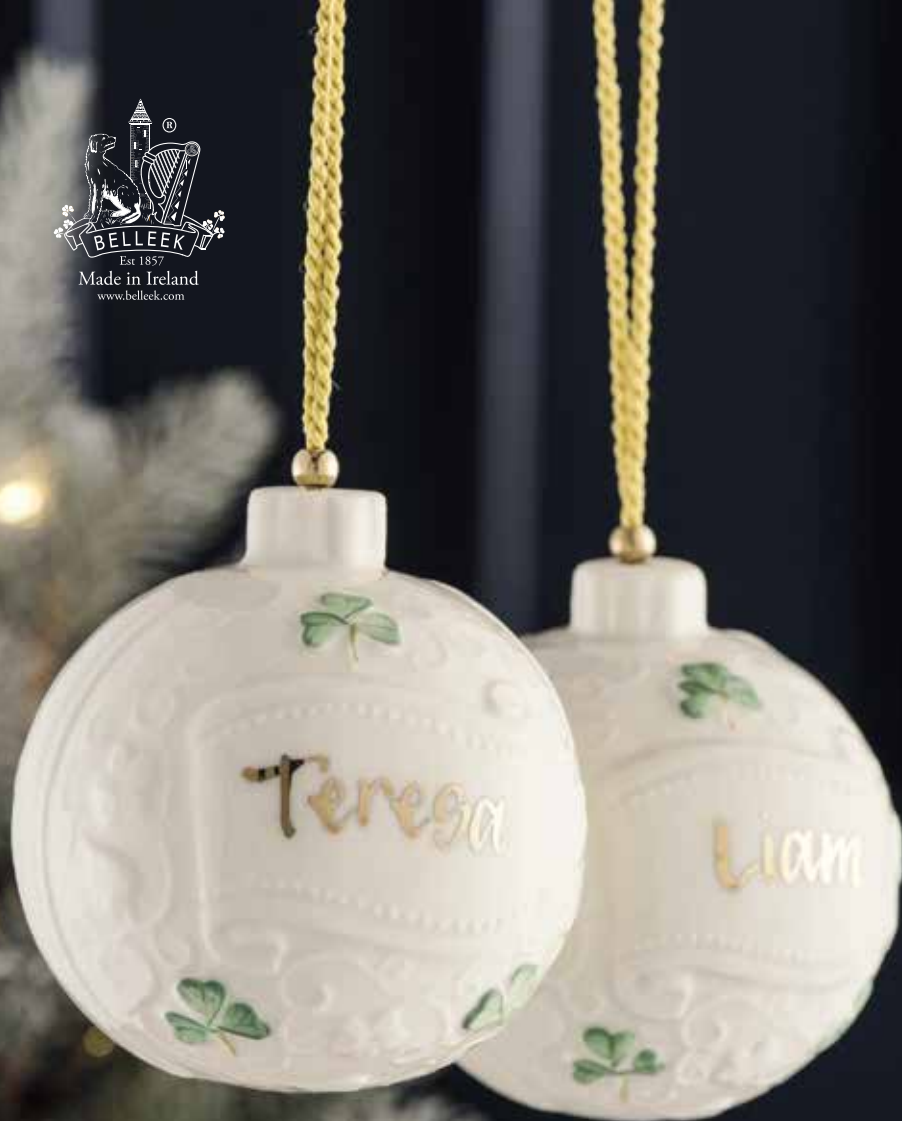
3621 Personalised Bauble 7.1cm (W) x 7.9cm (H)